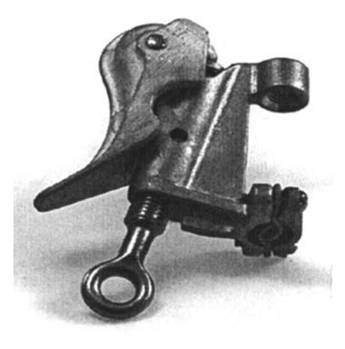
FIG. 3 Style II Duck Bill Shape Clamp

10.1 Materials used shall meet the requirements of 9.1.