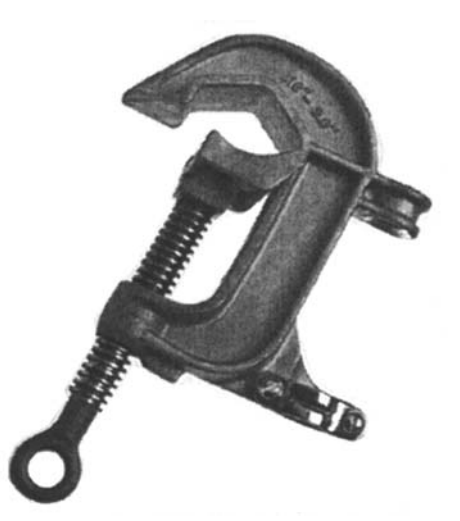
FIG. 2 Style II "C" Shape Clamp